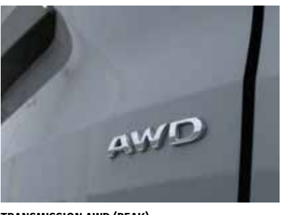
TRANSMISSION AWD (PEAK)