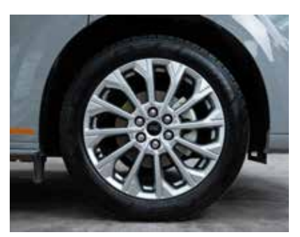
19" ALLOY WHEELS (URBAN)