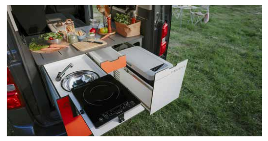
4 sleeping capacity, integrated kitchen and complete interior furnishings to accompany you through life's big moments.